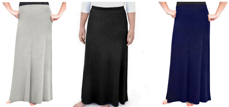
Examples of maxi length skirts