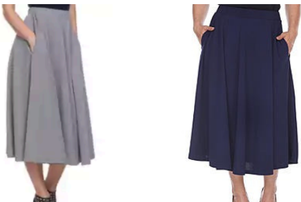
Examples of midi length skirts: